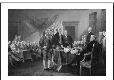
July 4, 1776: The Articles of Independence is signed, formally declaring the 15 united states to be an independent nation.

Grandpa loves to drag out his photo album and talk about the good old days. Unfortunately, his memory isn't what it used to be.