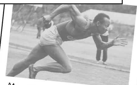
May 25, 1932: Jesse Owens competes in the Big Ten Championship, setting 6 track and field records in the span of 45 hours.

April 15, 1912: The Titanic sinks en route from London, UK to New York, USA. The wreck of the ship is not found until 1965.